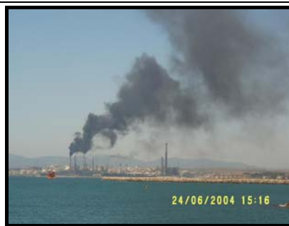
Oil Refinery Emissions