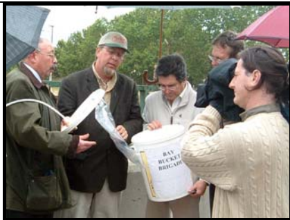
Bay Bucket Brigade