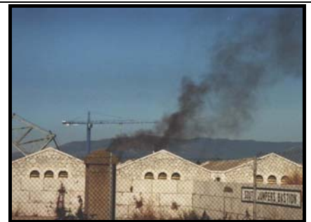
Gibraltar Power Station