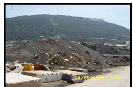
Mountain of grit at Cammel Laird

The ESG has this year been working on the above captioned issues among others, by meeting or contacting industry and Government; writing press releases and pressing for best available technology to be applied in all areas. The group states that until such time as we in Gibraltar have an environmental policy and charter we shall continue to see decisions being taken solely on economic grounds and this is simply no longer acceptable!