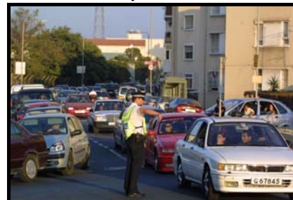
Traffic in Gib