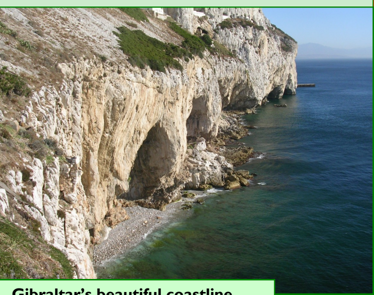
Gibraltar's beautiful coastline