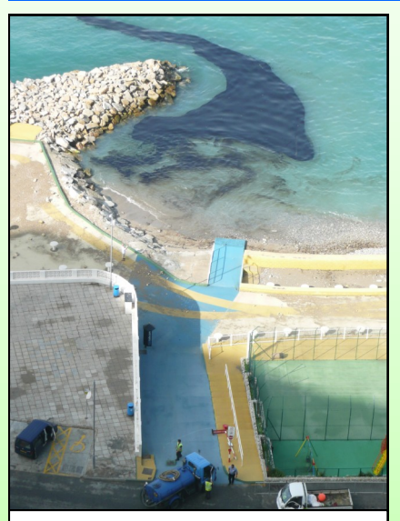
Oil slick reaches camp Bay