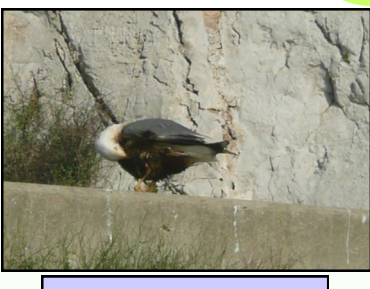
Seagull coated in oil