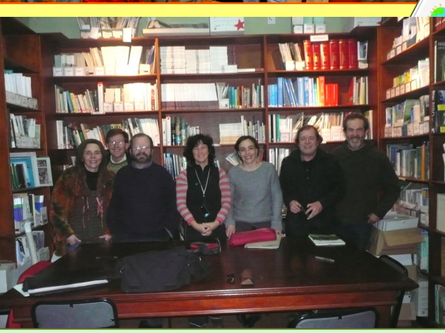
VERDEMAR, GONHS, ESG, GREENPEACE and AGADEN— Environmental NGO's at one of their recent meetings discussing regional issues