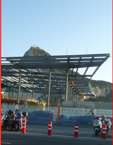
Massive new airport building going up fast- Where is the famous Rock of Gibraltar???

SIGN UP FOR 2010 CLEAN UP THE WORLD!! CALL 200 48996