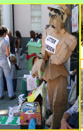
Cry out for litter wardens

Promoting the service and encouraging the citizen and business to recycle is also a government responsibility. A promotion campaign reaching each and every household and business is necessary and what better way than using the utilities bill service and enclosing green advice and information?