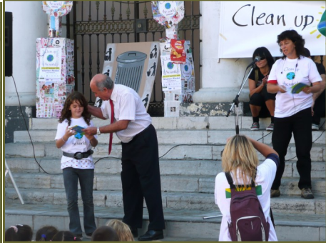
Minister for Environment hands out awards for green pupils!