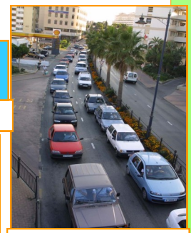
Winston Churchill Av.