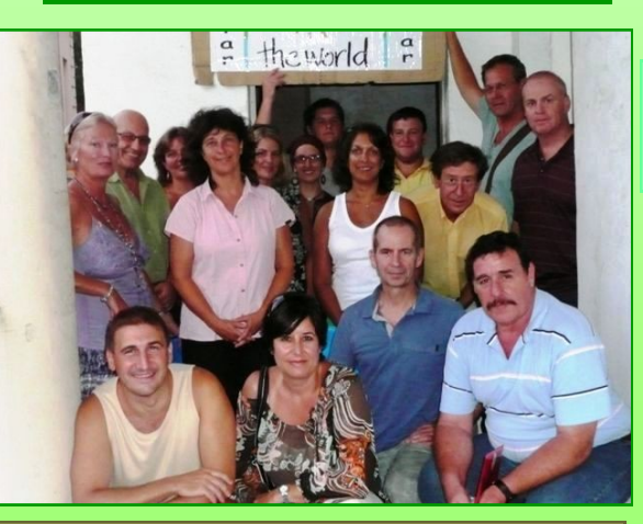
CUTW Team leaders at planning session August 2009