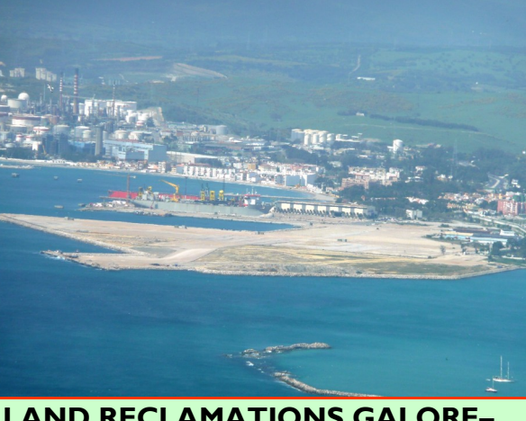
LAND RECLAMATIONS GALORE-WHERE ARE THE EIA'S??